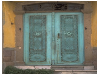
OCEA WOULD LIKE TO ASSIST IN OPENING THE NEXT DOOR

The Orange County Escrow Association wants to help individuals who have lost their escrow job, due to market conditions, find new positions within our dynamic industry!